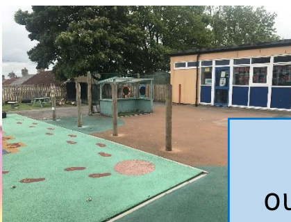
Our outdoor area