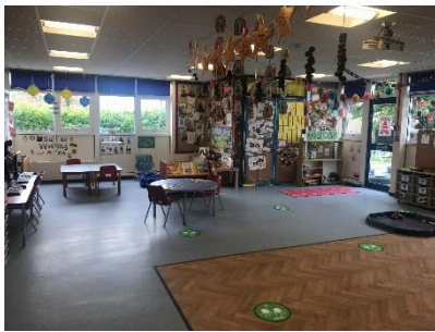
Inside class 1

Lots of things are still the same – your room will still be full of love and laughter, just like it always was. Here are some pictures of what the room will look like: