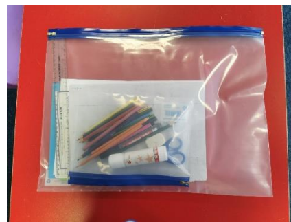
Children will each get an individual pack of resources

For now, our room will be like our own little bubble. We can play, learn, have fun and care about each other inside our bubble.