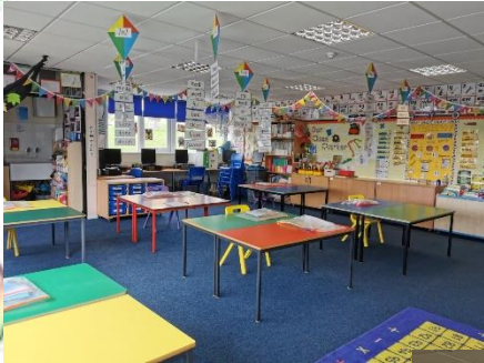
Inside class 5

Lots of things are still the same – your room will still be full of love and laughter, just like it always was. Here are some pictures of what the room will look like: