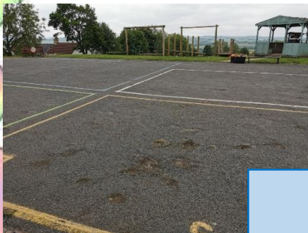
Our outdoor area