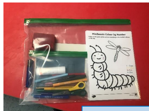
Children will each get an individual pack of resources

For now, our room will be like our own little bubble. We can play, learn, have fun and care about each other inside our bubble.