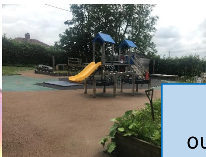
Our outdoor area