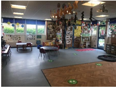
Inside class 1

Lots of things are still the same – your room will still be full of love and laughter, just like it always was. Here are some pictures of what the room will look like: