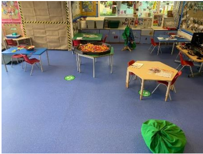
Inside Class 2

Lots of things are still the same – your room will still be full of love and laughter, just like it always was. Here are some pictures of what the room will look like: