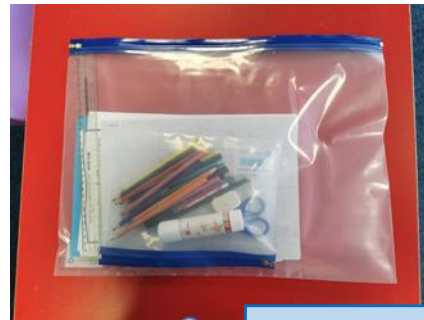
Children will each get an individual pack of resources

For now, our room will be like our own little bubble. We can play, learn, have fun and care about each other inside our bubble.