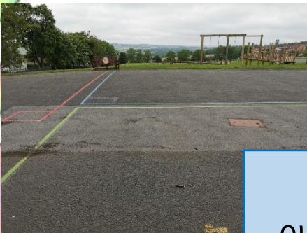
Our outdoor area