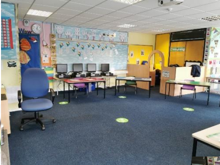
Inside class 4

Lots of things are still the same – your room will still be full of love and laughter, just like it always was. Here are some pictures of what the room will look like: