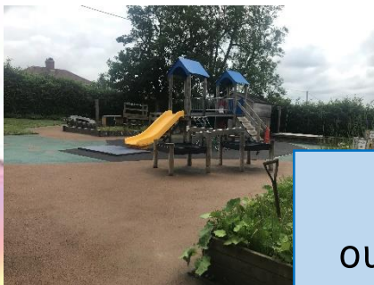
Our outdoor area